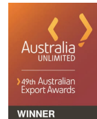
Award certificate for the Australian National Export Awards 2011