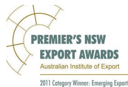
Award certificate for Premier's NSW Export Awards 2011